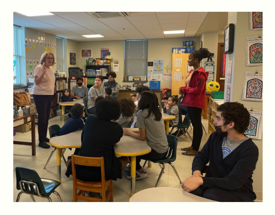
8th Grade and PK Buddies learn sign language together! PK - Grade 5 have bi-weekly ASL classes.

Individuals or businesses that have a PA tax liability are eligible to redirect their tax dollars to St. Peter the Apostle School and receive a 90% tax credit. These funds are used for tuition assistance for our students and enable many families to attend our school!