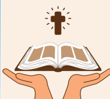
2 Corinthians 5:17

Please contact our rectory office for more information (215)627-2386