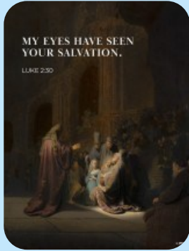
The Presentation of the Lord